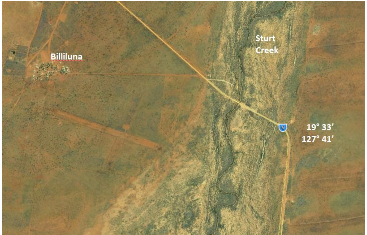
The Sturt Creek Crossing near Billiluna on the Tanami Road